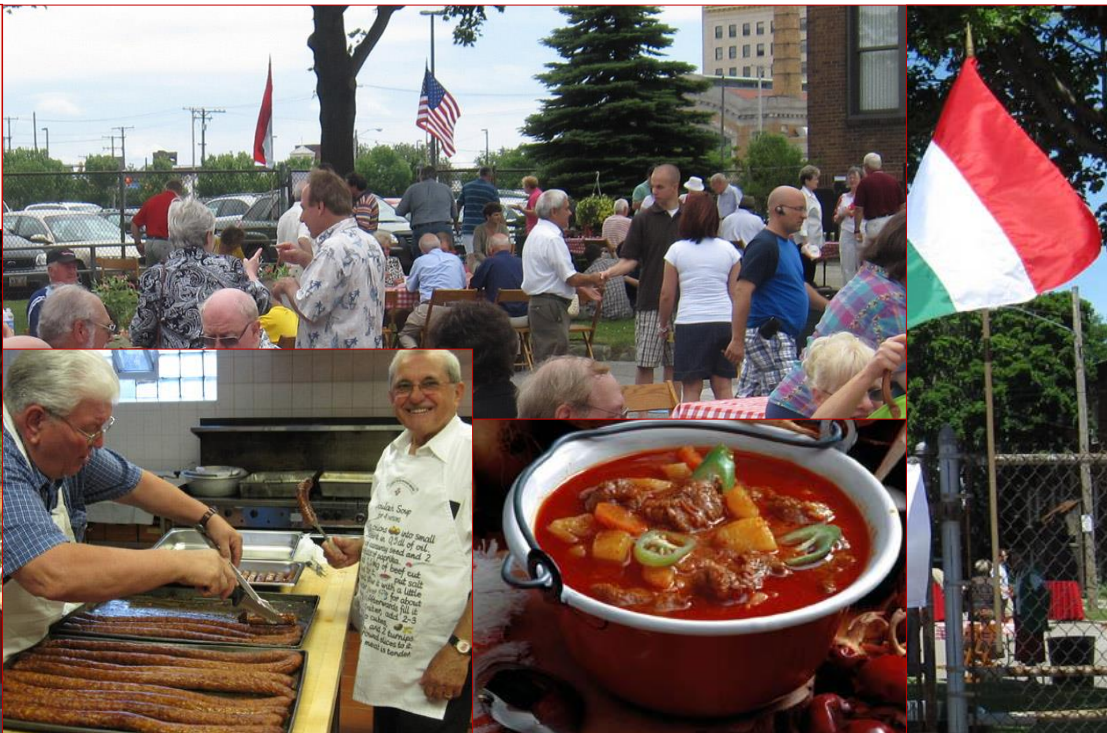
Flyer design by L&F Somogyi

Goulash , also typically known as Gulyás, is a stew or a soup, typically made of beef, red onions, vegetables, spices and ground paprika, etc. The name comes from the Hungarian cattle herdsman "gulyás" (pronounced goo-yash ).